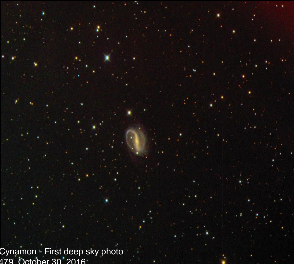
Chuck Cynamon - First deep sky photo NGC 7479, October 30, 2016